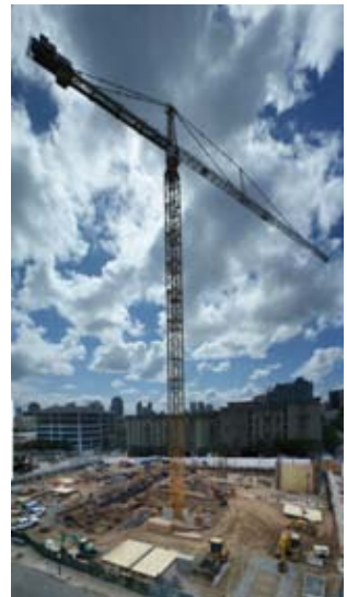
This tower crane at the Math & Social Sciences building job site will be among four cranes operating concurrently.