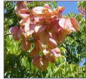
Chinese Flame Tree