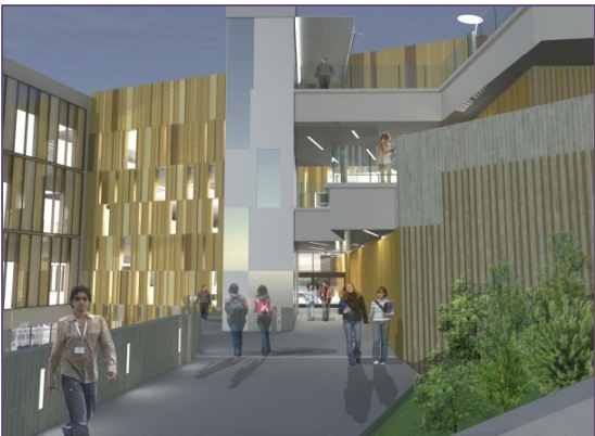
View from lower plaza

The building is designed to meet LEED Silver certification. Projected energy savings of 340,000 kWh annually are 38% better than state requirements. Water-efficient plumbing, irrigation and landscape will result in a water savings of 40% on the building use and 50% on landscape. The project will include materials and finishes that include recycled content, attention to Indoor air quality and the use of natural daylight.