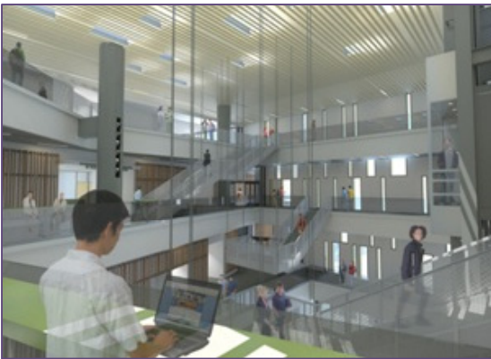
View of indoor lobby

The new four-story, 85,000 gross square foot building will include new facilities for student services on campus. Services include Admissions, Financial Aid, Evaluations and Testing, Counseling, Student Government, Disabled Student Services, Information and Outreach, classrooms, conference areas and a Terrace Café. The project also includes a new express elevator between the lower parking lot and the upper campus. The facility is designed to obtain a Leadership in Energy and Environmental Design (LEED) Silver certification by the United States Green Building Council (USGBC).