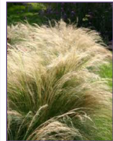
Mexican Feather Grass